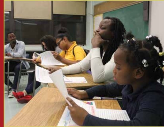
Power of Choice curriculum materials are reviewed by both students and parents during a Family night at Coopers Poynt Middle School in Camden, NJ.

during the high risk after-school hours, and second, the need for regular, moderate to vigorous physical activity and nutrition education to address very high rates of obesity among inner city youth. Legacy served more than 600 young people across four sites (Camden, Chester, Mantua, and Hunting Park) in 2014. For the calendar year 2015, Healthy Advantage has been rolled into the expanded program now known as Changing the Game.