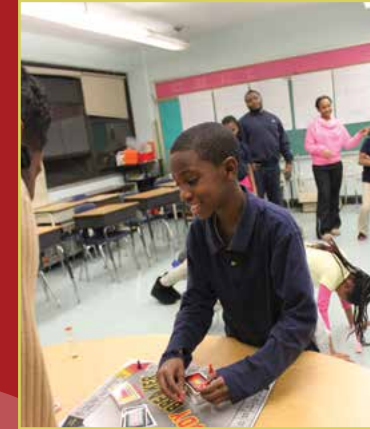
Off-court fitness during a Family night is motivated through a board game, Body Breakers, which provides teams with short physical challenges like push ups and plank exercises.