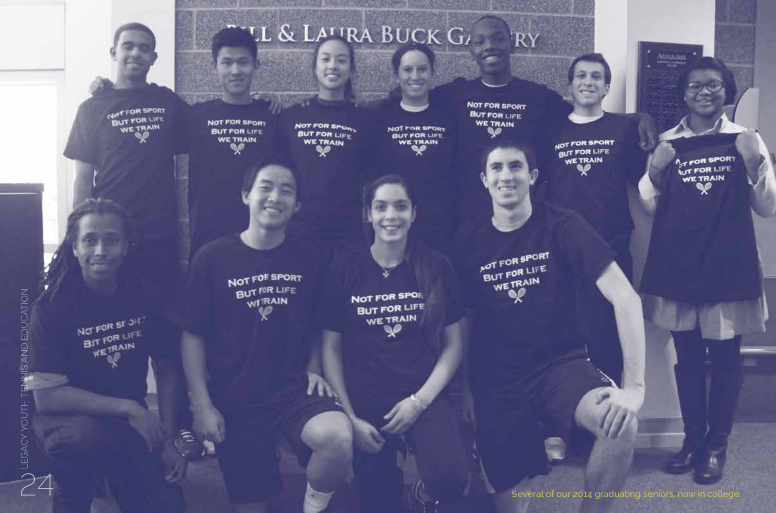
Several of our 2014 graduating seniors, now in college.